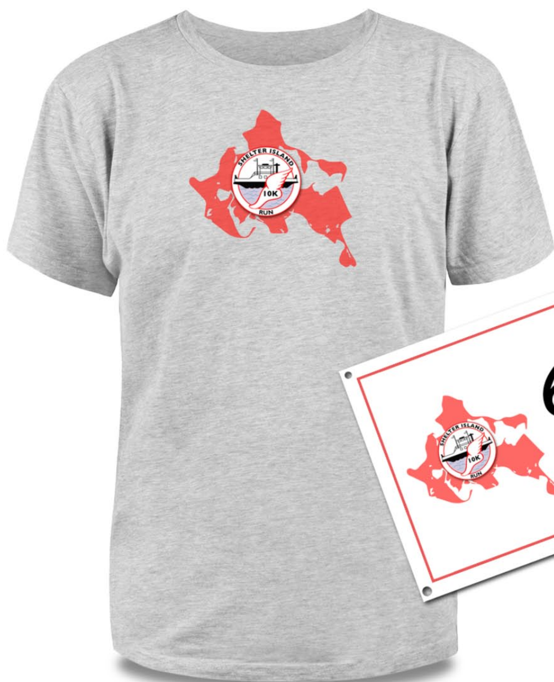
SHELTER ISLAND FINISHER TEE